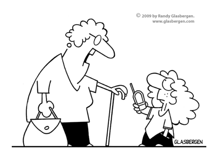
"Wireless communication is nothing new. I've been praying for 75 years!"

All men are invited to the annex each Tuesday morning at 6:20 a.m. for a time of breakfast, prayer and fellowship.